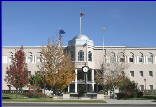
Nevada Legislative Counsel Bureau Legislative Police 401 South Carson Street Carson City, NV 89701 (775) 684-6812

TRUST earned by managing and maintaining the Unit's resources responsibly, and conducting ourselves in a way that fosters the highest level of confidence from the legislators we work with and the citizens we serve.