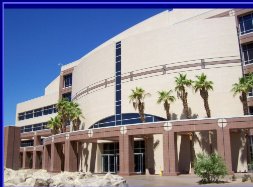
Nevada Legislative Counsel Bureau Grant Sawyer Building, Rm. 4400 555 East Washington Avenue Las Vegas, NV 89101

http://www.leg.state.nv.us/App/ CareerOpenings/A/